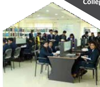
Well Stocked Library