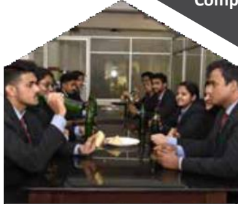
Canteen and Cafeteria